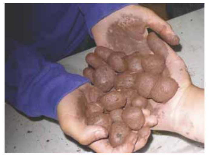
"Making seed balls is kinda like making meat balls" - Grade 3 student Photo credit: Nature Centre

Our amazing volunteer, Neil, teaching students about the Black Oak savannah. Photo credit: Nature Centre