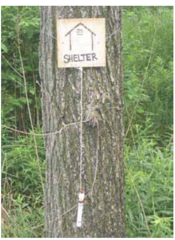
One of the many stations students had to find while role-playing an urban animal in our High Park survival game.