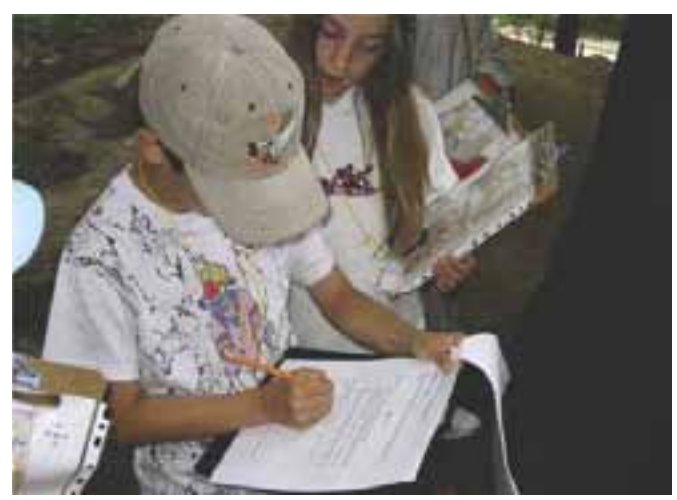
Grade 5 students finding their way using a map and compass.

Donations Needed! The Nature Centre is in need of an old blender for a papermaking activity we would like to do this fall. If anyone has one to donate, we would be very happy to receive it! Please give us a call at 416-392-1748 ext.6 or send us an email at: naturecentre@hpicharity.org.