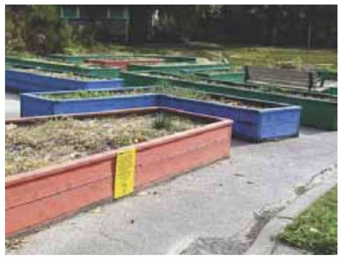
Raised Beds in Children's Gardens

Christine Klianis Children's Garden and Exploring Toronto Programs Niagara C.C. 700 Wellington St. W. Toronto, ON M5V 1G7 Tel. 416-338-5055 Fax: 416-392-1319 kidsgrow@toronto.ca www.toronto.ca/parks/programs/children.htm