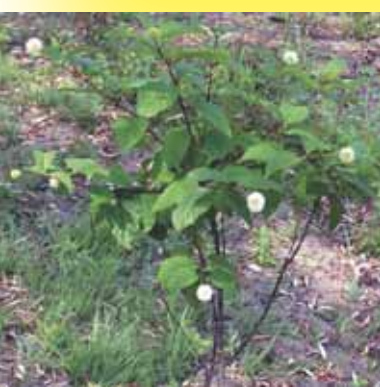
New Jersey Tea

fruit of these plants. This plant has a pair of stalkless leaves on the stem below the flowers and also has stalkless basal leaves. It has delicately fringed white snowflake-like flowers that bloom from April to May. The plant grows 10-18 inches tall or 25-45 centimeters and grows in moist rich forests of southern and south central Ontario where it gets sun in the spring and then shade.