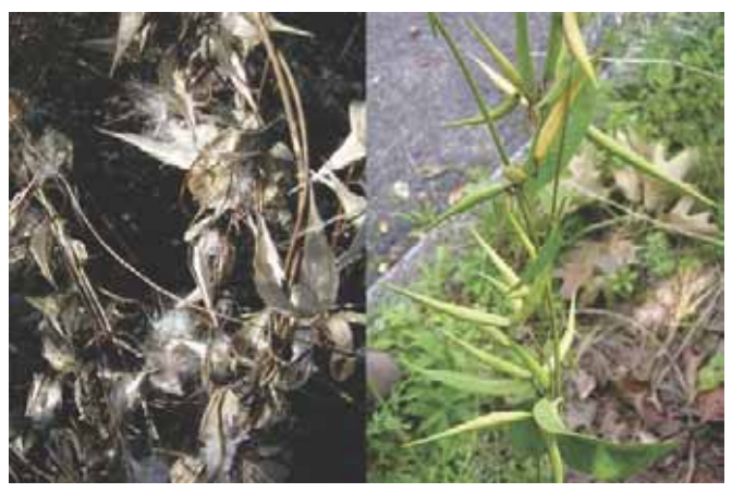
Dog-strangling vine seeds & seed pods. Generally seed pods develop mid-July and open mid-late August.

plants and outcompete them for sun and other resources. The plant was introduced from Russia and Ukraine and it is therefore able to grow without natural controls. Dogstrangling vine can easily be identified by common traits in the milkweed family including star shaped flowers, green oval leaves, seed pods and fluffy seeds. Two species of Dog-strangling vine are found in Toronto and within High Park, although the Pale Dog-strangling vine, Vincetoxicum rossicum, (bottom flower picture) is much more common and widespread.