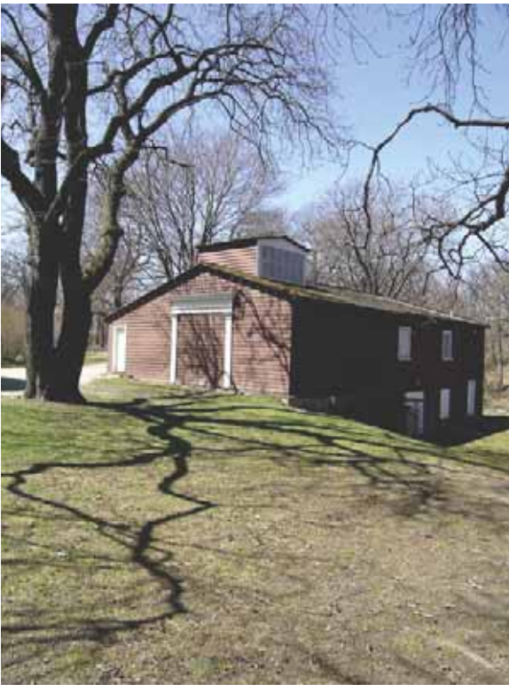
Colborne Lodge Grounds

Pre-registration and pre-payment required. Adults:$10, Children 8 & Up:$5