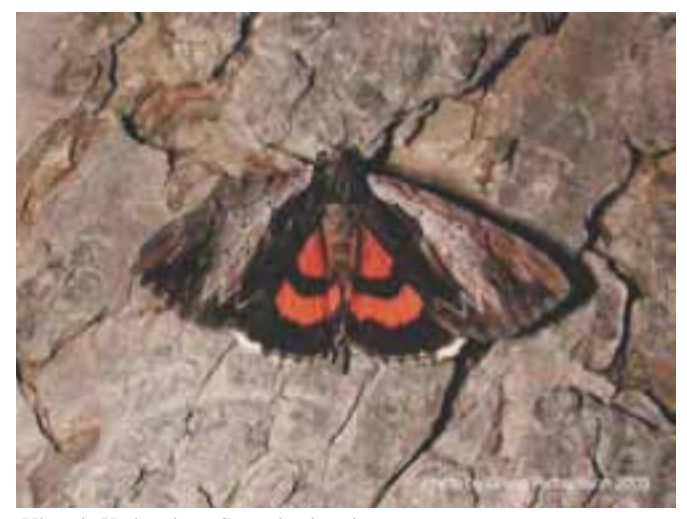
Ultronia Underwing , Catocala ultronia

east of the Forest School to attract the moths. Fermented bait made of sugar, ripe bananas and other treats, smeared on nearby trees, also drew them to the area. And the moths did not disappoint – a total of 58 species were identified and passed around in jars for everyone to see, then released into the night. Among the showiest were five species of Underwings, such as the Ultronia pictured here – apparently drab brown until they spread their forewings to reveal lipstick-bright coloured hindwings.