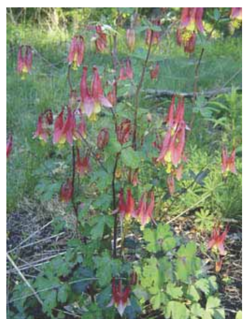
Wild Columbine