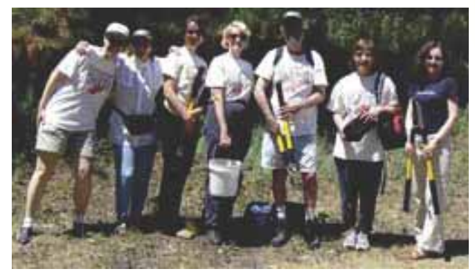
Picnic Potluck

On July 10th the VSP volunteers watered some of the Adopta-plots and cut buckthorn just east of the greenhouses. The event ended with a picnic potluck meal and celebration of the nine years that the Volunteer Stewardship Program has been operating. Good food and great conversation were enjoyed by all.