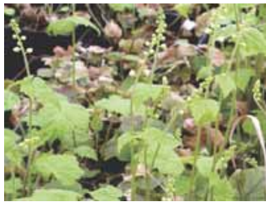
Mitrewort

Well it's that time again...time to discuss the ABC's of the VSPs. Last new newsletter ended with the letter "L" so here are M, N, and O.