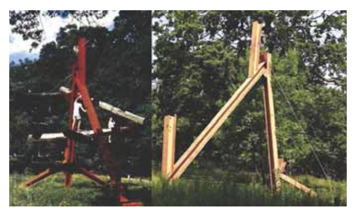
"No Shoes" by Mark di Suvero - original (left) and today (right)

It all began in 1967, Canada's Centennial Year when it was decided to hold an International Sculpture Symposium in Toronto with High Park (Sculpture Hill) as the venue. Interest was solicited from around the world and ultimately 12 international artists were selected including four from Canada. The artists all came to Toronto and worked on site, using the former Forest School to store their tools and gear. In the end, ten sculptures were completed, seven of which remain. (The three others went to the National Gallery in Ottawa, the McMichael Canadiana Collection in Kleinberg and the Art Gallery of Ontario.) Let us examine those that are still in place.