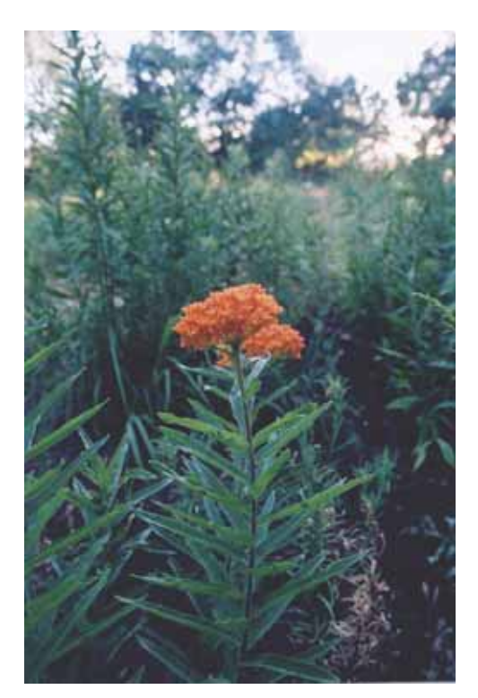
Butterfly Weed (left)